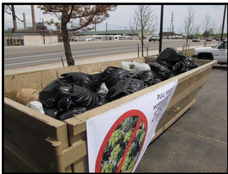
Figure 4: Bags of pulled Myrtle spurge collected in one municipality were prominently displayed. Participants received three potted native plants regardless of the amount of plant removed.

plant, to the benefit for something the individual values, in this case ecosystem health. This is not unlike military recruitment, in that it places personal risk at a counterpoint to personal benefit gained by facing danger in loyalty to a valued commitment (the nation). This similarity is not only covert; the recruitment material for 2016 included a photo mimicking the “Uncle Sam” recruitment posters of WWII. Across a photo of very determined looking woman pointing at the camera are the words “WE WANT YOU!!! TO WEED! Purge the Spurge 2016; Join the Movement.” Text in the accompanying email announces that Myrtle spurge “will eventually take