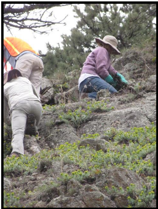
Figure 6: Steep hillsides do not dissuade volunteers' removal efforts.

Volunteers' dedication to detail is indication of their commitment to environmental