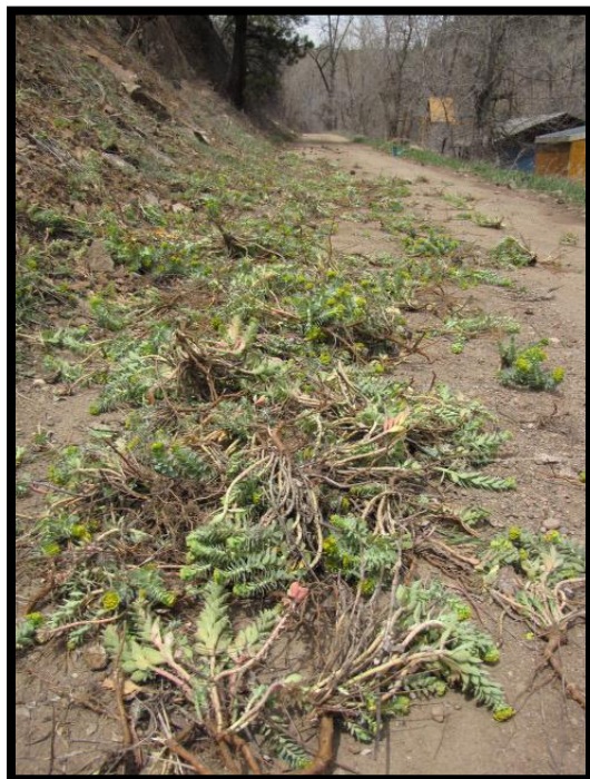
Figure 7: Pulled spurge plants litter the driveway at one home.

Colorado the illegal status. These gardeners are aesthetically motivated, and reluctantly remove Myrtle spurge. The incentive of free native plants in exchange for spurge addresses the need for a “softer approach,” however my observation revealed the exchange did not satisfy a significant number of participants. Two or three native plants are not sufficient to replace the area of