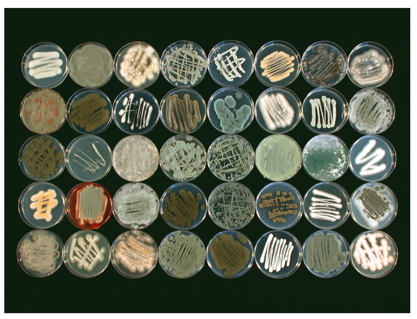
FIG 1 Morphological diversity of fungi collected from a biotic host. Fungal collection isolated from a marine sponge, Ircinia variabilis (formerly Psammocinia sp.). For details, see Paz et al. (35).

tions is largely uncharted, although recent studies have shown marine fungi to be rich sources of novel biosynthetic clusters and secondary metabolites (52, 53).