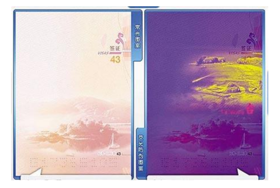
Figure 2. 2012 PRC passport pages with images of Sun Moon Lake, Taiwan.

printed in the new PRC passport as an image that represents and performatively claims Taiwan as a province of China (see Figure 2).