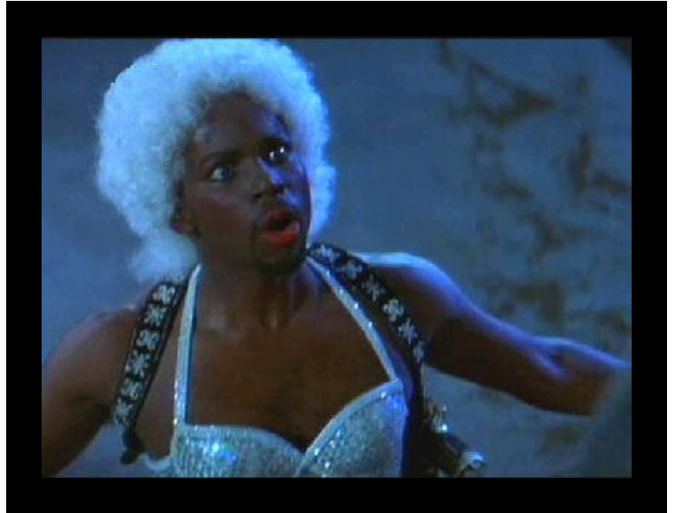
Luhrmann's Mercutio in costume prior to the Capulet ball.

but rather that Luhrmann wants to make his reading of Romeo's struggle between male-male love and heterosexual love as evident as possible. Although Mercutio's costume could be dismissed simply as part of the fun and games of the Capulet costume ball, Luhrmann specifically turned him into what can be best described as a transvestite drag queen, and the significance of this costume should not be overlooked. The significance of the knight and angel