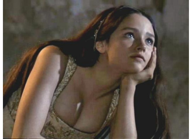
Olivia Hussey as Juliet leaning on her balcony ledge. Image location: http://transmedialshakespeare.files.wordpress.com/2011/03/olivia-hussey.jpg

sexualized girl is evidenced in the scene where she and Romeo consummate their marriage. Here, Hussey performs a nude scene as Juliet, and her breasts are completely exposed at one point as she lies in bed with Romeo. I suggest that these representations of Juliet in Zeffirelli's film actually objectify Hussey's Juliet to a much greater extent than Luhrmann's Juliet, despite