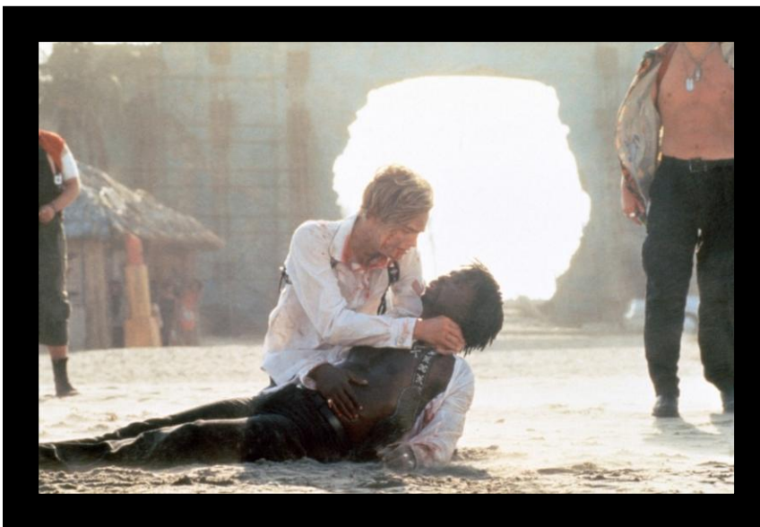
Mercutio dying on the beach in Romeo's arms in Luhrmann's Romeo + Juliet.

Particularly foreboding, though, are Mercutio's very last words; with Romeo still cradling his head, Mercutio slowly repeats to him the curse of "a plague on both your houses." Romeo, seeing that Mercutio dies after these words, heartbreakingly screams "No!," with renewed thunder and lightning crashing in the sky behind him. Tybalt and the Capulets take