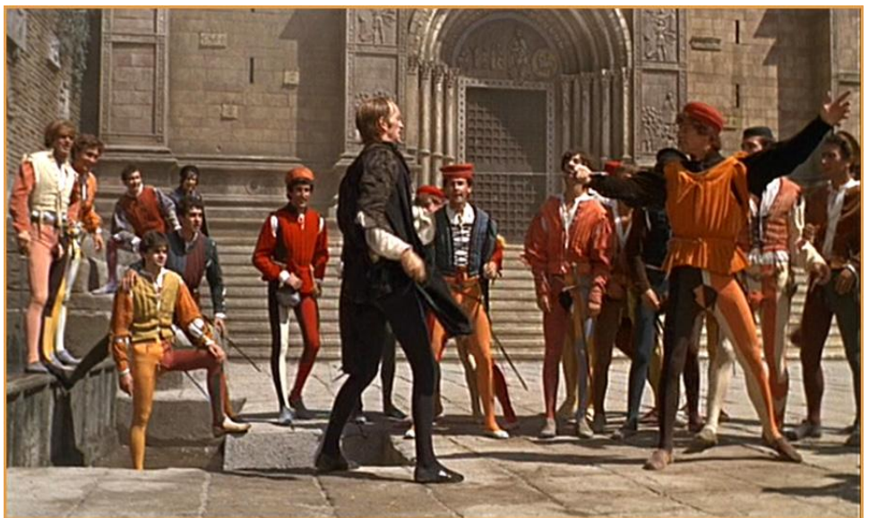
Zeffirelli's Tybalt and Mercutio during the fight scene.

if the duel is merely continuing the show of male bravado and poses no real threat to either man’s well being. In fact, there are several instances when both Tybalt and Mercutio would have had an opportunity