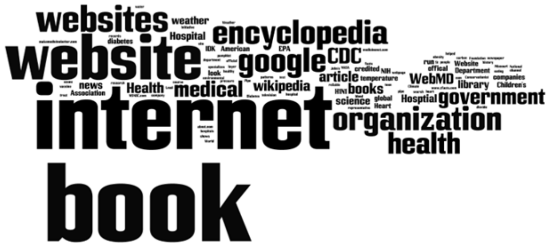
Figure 2. Words in sources named by novices (n=100) to learn more about the topics of diabetes, high blood pressure, the Deepwater Horizon oil spill, and a volcano ash plume.