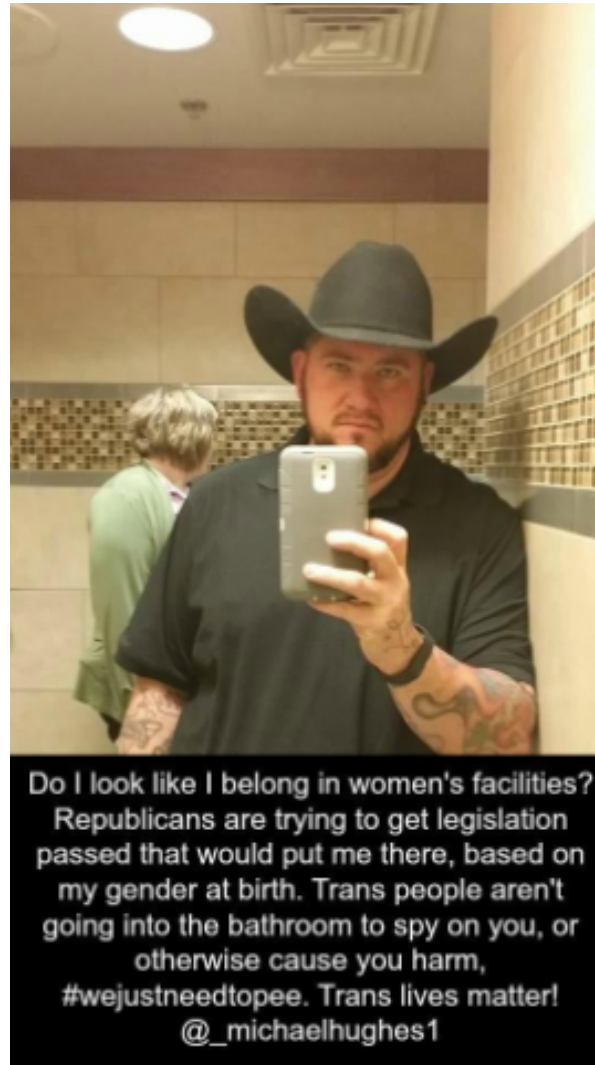
Figure 3. Example of photo campaign against transphobic bathroom legislation in North Carolina (Hughes 2015).