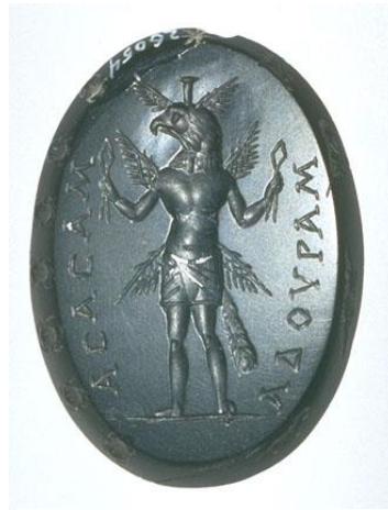
Figure 1 (Reverse)

The widespread invocation of Michael in magical contexts undoubtedly resulted from his character's prominence in Jewish and Christian traditions. 16 Nonetheless, by depicting Michael as a mutable pagan god operating alongside spirits derived from various Greek, Near Eastern, and Egyptian religious traditions, magical spells introduced portrayals of the Archangel evoking