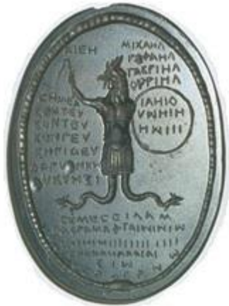
Figure 1 (Obverse)

In light of the doctrinal dialogues discussed in previous chapters, it is notable that many spells conflate Michael's role with Christ's. 14 Furthermore, not all spells were written on papyrus: a magic gem (Fig. 1) recovered in Egypt includes the names "Michael, Gabriel, Raphael, and Uriel" alongside numerous magic words and an image of a cock-headed snake-legged god. 15