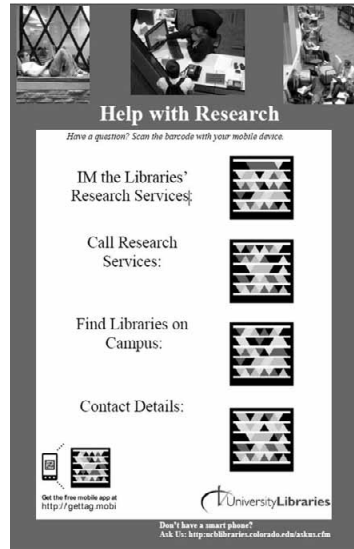
Figure 2. Barcode Poster: Reference

campus where students often congregated such as the main student center which houses dining areas, classrooms, and computers labs. Poster display was coordinated with campus housing services to distribute posters in student dormitories. Finally, posters were also hung in specific librarian liaison departments. Though the librarians identified a number of places one might distribute posters to connect with students in their own environments, the locations were kept to a minimum for this stage of the project. Furthermore, statistics and analysis of posters hung outside the library were not included in this study due to the more recent implementation.