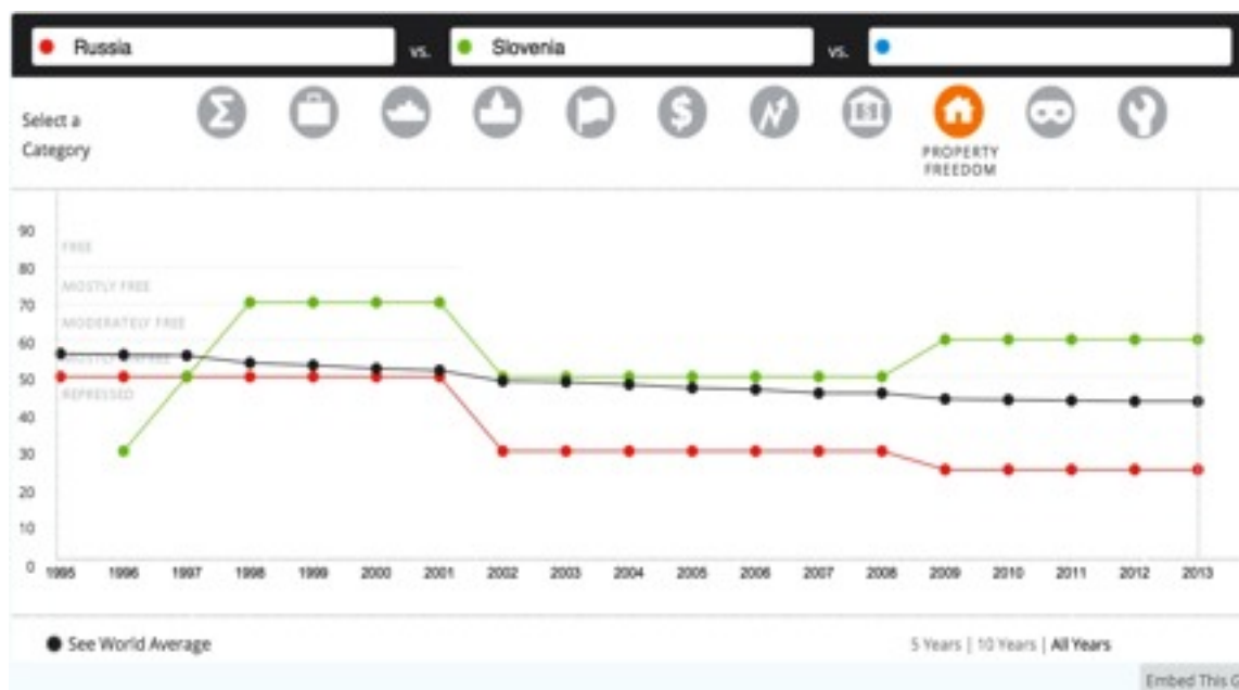
Graph 2: Property Freedom Rating, Russia and Slovenia, 1995-2013 8

The property right quality data for Russia, Slovenia, and the world average over eighteen year period, from 1995 to 2013, is graphed below. The y-axis of the graph represents the property freedom scores from 0 to 100. The scores are into five categories, from 0 to 50, the rights to own property are repressed, from 50 to 60, the property rights is mostly free, from 60 to 70, the property rights is moderately free, from 70 to 80, mostly free, and from 80 to 100, free. Our findings are consistent with our model. In the last five years, Slovenia's quality of property rights score went up from 50 to 65. The property freedom is ranked as moderately free; "enforcement of property rights is lax and subject to delays; corruption is possible but rare, and the judiciary may be influenced by other branches of government' (The Heritage Foundation). Our model predicts that a country with the property rights score 65 should have the stray dog population