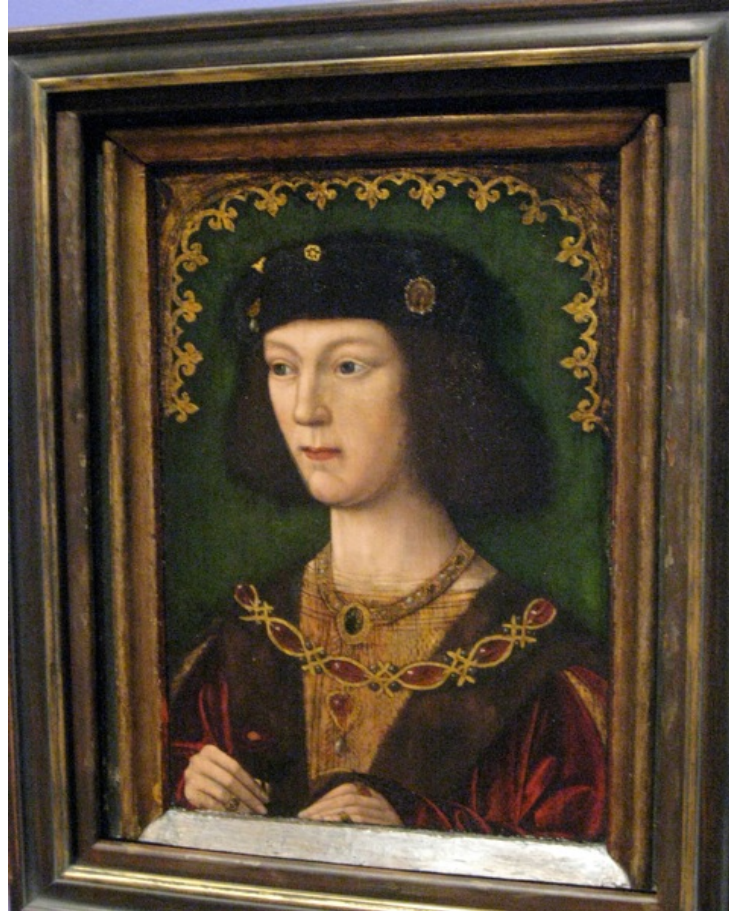
Figure 1: Artist Unknown, “Henry VIII” c. 1513. Oil paint on wood oak. (Denver Art Museum, Berger Collection, TL-17964).

At the dawn of his reign, Henry was described as the embodiment of all the virtues of a Renaissance prince. In 1511, Edward Hall, in Chronicle, The Union of the Two Noble and Illustre Families of York and Lancaster , wrote that Henry excelled “in shotyng, singing, dancing, wrastelyng, casting of the barre, plaiyng at the recorders, flute, virginals, and in setting of songs, makyng of baletts, & dyd set [two] godly Masses...” 58