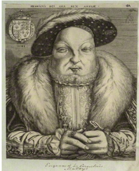
Figure 3 Cornelis Metsys (Massys), “King Henry VIII,” (c. 1548). Line engraving.

fair siege...his Grace findeth himself well, saving his Highness saith he hath a little soreness in his body.” 87