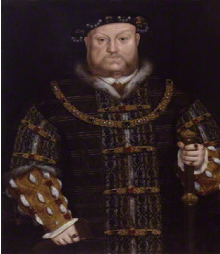
Figure 2: Unknown Artist, “King Henry VIII,” (c. 1542). Oil on panel. (The National Portrait Gallery, NPG 496)

His size was frequently referenced in letters. In 1540, a letter asked if the king “were not waxen fat...it appeared that his Majesty, since my being in England, was become much more corpulent.” 80 By 1542, the king was written of as “already very stout and daily growing heavier, already resembling his maternal grandfather King Edward, being about his age...He seems very old and grey...” 81 According to Boorde: