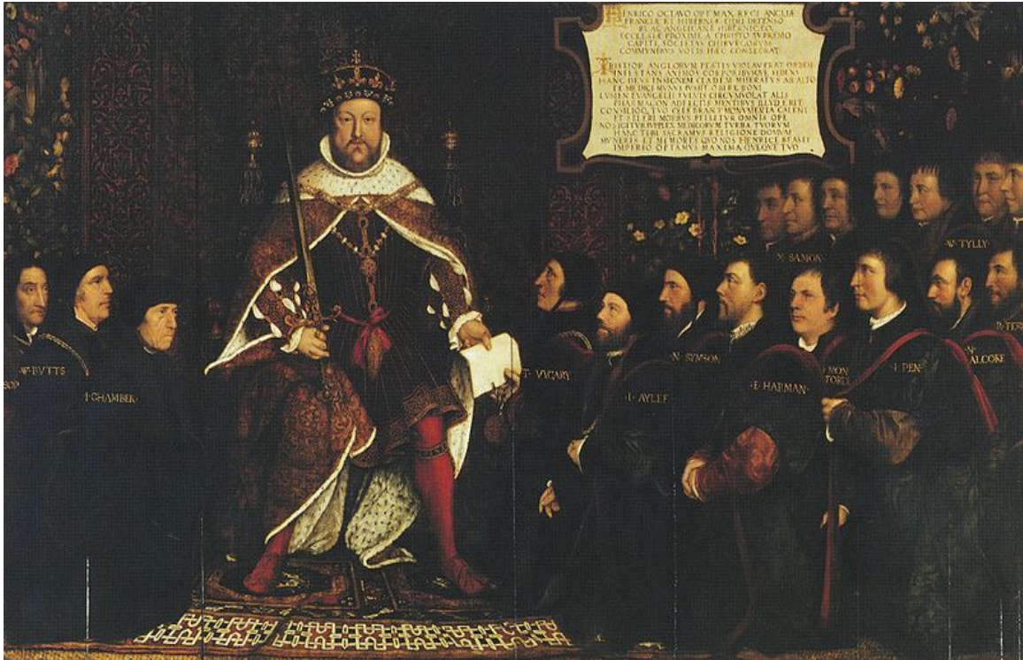
Figure 6: Hans Holbein the Younger, “Henry VIII and the Barber Surgeons” (c. 1540). Oil on oak. (London: Royal College of Surgeons of England).

The power of this Act, and the King’s pivotal role in securing this union, was immortalized in Hans Holbein the Younger’s painting of Henry VIII granting the Charter to Vicary and his fellow professionals. In this image, Henry’s royal physicians Sir William Butts and John Chambre are shown kneeling on the king’s right hand side while Vicary and the Company of Barber and Surgeons are kneeling to the king’s left. As all men in the king’s presence have removed their caps and are gazing up at the king, Holbein visually demonstrated the king’s magnificence and power, and furthermore created a gulf between the divinely appointed king and his mere mortal subjects. Because the physicians are seated at the right hand of the king, the image suggests that physicians