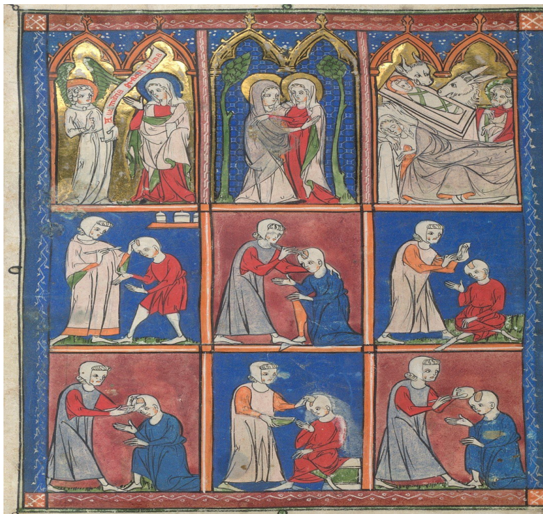
Figure 4: Roger Frugard of Parma, Practica chirurgica , “Life of Christ; Surgical Procedures.” (The British Library, Sloane MS 1977, f. 2). 145

standard surgical reference for nearly a century after its original publication in 1514. 143 Henry was also in possession of a French version of Roger Frugard of Parma’s (a twelfth-century surgeon) Practica chirurgica . 144 The manuscript contains illustrations of apothecary and surgical procedures. It is difficult to discern whether Henry studied these books or whether they were references for his physicians. Nonetheless, as Vigo and Roger Frugard of Parma were noteworthy surgeons, the texts were equally prestigious in the surgical field and would have required a trained mind to interpret their illustrations.