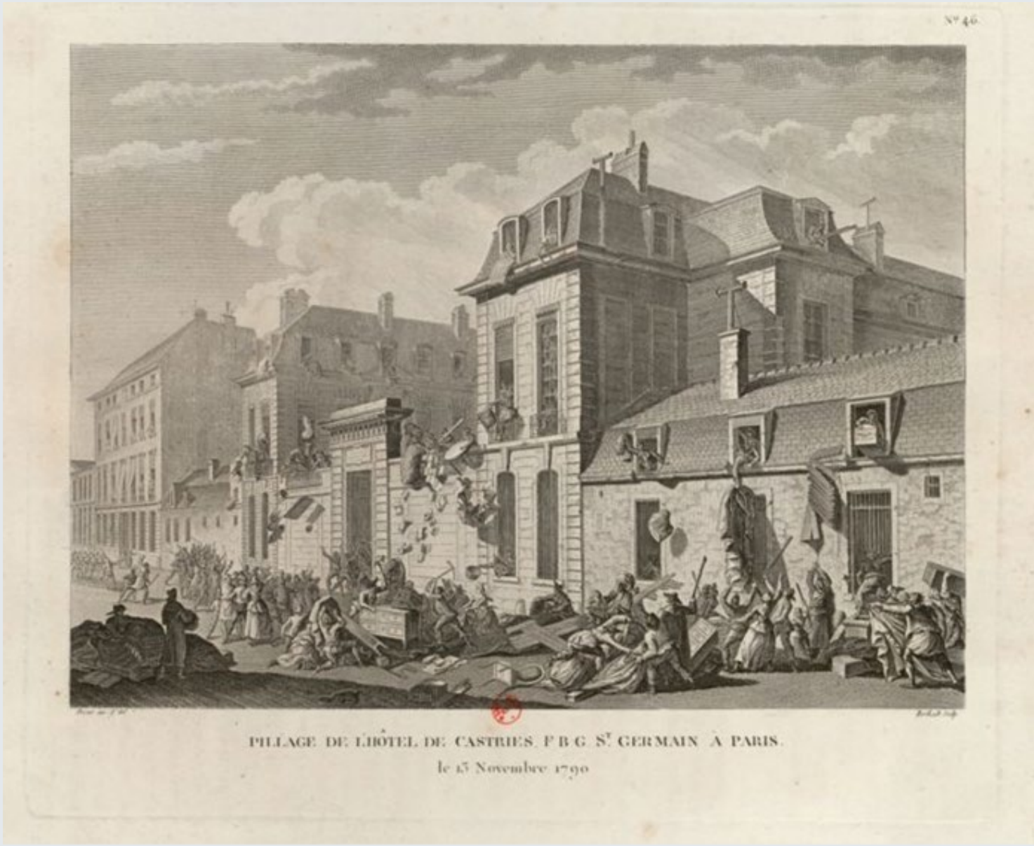
PILLAGE DE L'HÔTEL DE CASTRIES. F. B. G. S T GERMAIN À PARIS.