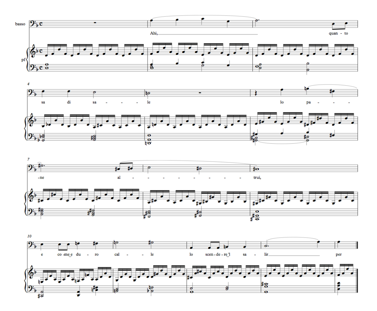
Fig. 7 - Opening measures of Ahi, quanto sa di sale lo pane altrui

the vocal part features an ascending, chromatic line through this unstable modulation, depicting the text as one "ascends" and "descends" the stairs of another. As a dramatic finish to the piece, Perosi sets the final statement by the baritone soloist by outlining an ascending arpeggiation of a fully diminished B chord followed by a drastic descent of a twelfth from a D4 down to a low A2, the tonic of an A major chord (V).