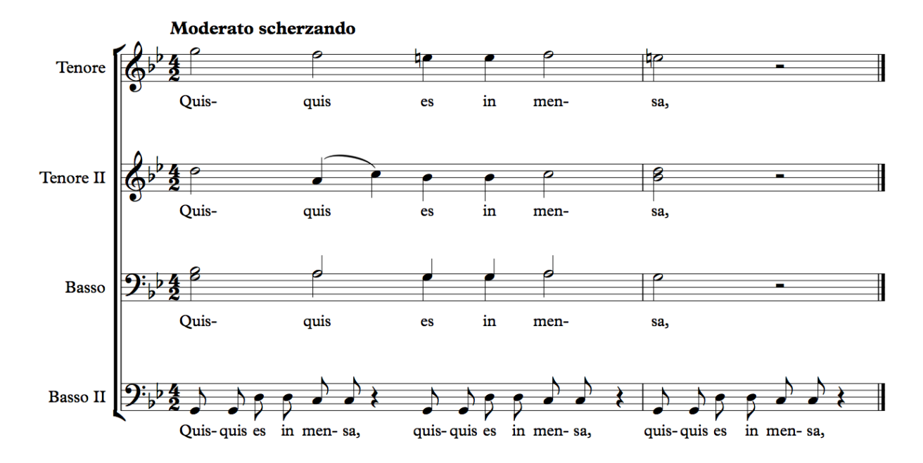
Fig. 11 - Opening measures of Quisquis es in mensa

Aside from the entertaining story regarding its creation, Quisquis es in mensa certainly deserves particular mention due to its bizarre ostinato outlined by the second basses: