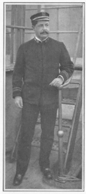
LIEUT, JAMES C. GILLMORE, U. S. N.,

Fig. 3 - Harper's Weekly, Vol. 43, p. 436: Abbate Perosi's "The Resurrection of Lazarus" 17