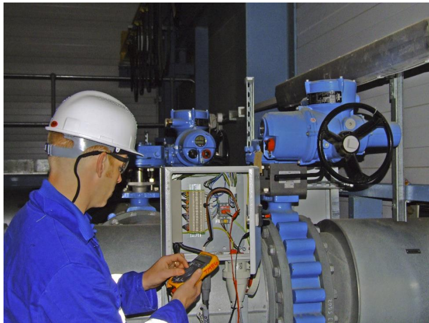
Figure 7. Earthquake early warning can automatically close or open valves, start or stop electrical equipment, open doors, sound alarms, or shut off power to protect water and wastewater systems.

An Internet-connected device (sometimes called a monitor or control) listens for the earthquake early warning message. When the message is received, the software evaluates the alert to determine whether it meets the criteria for acting. If so, the device operates an electrical relay, which either starts or stops electric equipment. The relay could be attached to almost any downstream device to cause an automatic action. For example, at a water or wastewater utility, the monitor could cause an outlet valve to close at a water supply reservoir, protecting the reservoir from draining through damaged buried pipe lower in the system. Other examples include stopping rotating machinery, opening a door, stopping a magnetic resonance imaging machine, sounding an alarm, or shutting off power to prevent an electrical fire.