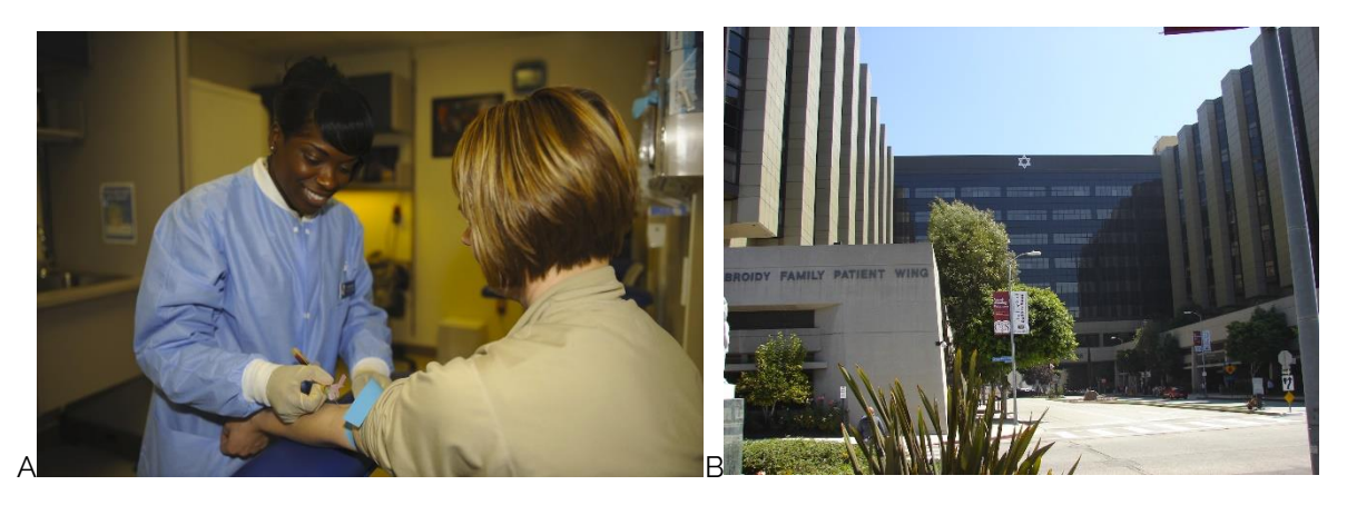
Figure 3. Earthquake early warning could help to avoid injuries in medical settings such as (A) phlebotomy labs. (B) Cedars-Sinai Medical Center in Los Angeles has implemented such a system

A public address system sounds an audible alert in a medical setting (Figure 3). Medical professionals hear the alert, secure sharp instruments, and take action to protect themselves, patients, or both. These actions can vary widely by setting: in a phlebotomy lab, withdraw needles and activate the safety feature; in a surgery, protect a patient from dust and prepare the patient for a delay in the continuance of the operation; secure dangerous equipment such as cauterizers; in a nuclear medical laboratory, shut down hazardous equipment; in other settings, warn patients to take a safe seat or lock wheelchair brakes.