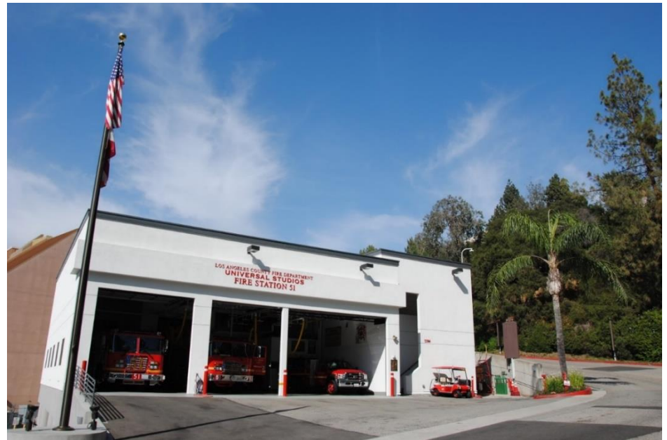
Figure 6. Earthquake early warning can automatically open fire station bay doors and sound an audible alarm through the fire station public address system, two-way radio system, or both

A device receives an alert via the Internet and through a hardware interface to the door controls, opens fire station bay doors to reduce the chance that doors will be jammed closed by racking damage to the station structure (Figure 6). The device also causes an audible alert to be broadcast through the fire station public address system, two-way radio system, or both.