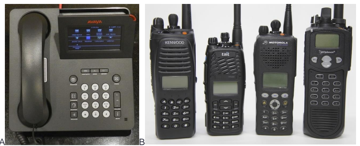
Figure 2. Audible warning for selected personnel can be delivered by (A) IP telephones or (B) two-way radios.

An audible warning is announced either through a radio system to select people carrying a two-way radio, or through the telephone system to select extensions. The warning instructs people to take immediate self-protective action against imminent ground shaking such as drop, cover, and hold on.