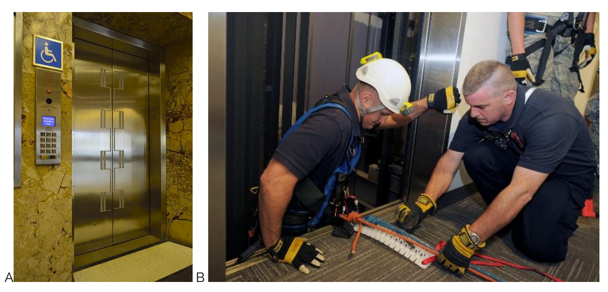
Figure 4. A. Elevators can lose power in earthquakes, trapping occupants. Automated elevator recall can move elevators to a nearby floor and open doors. B. In a large urban earthquake, it may take days or more before urban search and rescue personnel can extricate all occupants trapped in stalled elevators (Image credit: A. Raysonho @ Open Grid Scheduler / Grid Engine, 2015, Creative Commons CC0 1.0 Universal Public Domain Dedication; B. Public domain).

In a large urban daytime earthquake, 20,000 people could be riding in elevators with the doors closed and the elevator in motion between floors when power is lost, trapping them until power is restored or until firefighters can extricate them, which could be days in either case (Porter 2018; Figure 4). To reduce this problem, elevator cars connected to the earthquake early warning system receive a warning signal, automatically stop at the closest floor, and open the doors, enabling passengers to safely exit the elevator before shaking occurs or power is lost. If desired, the elevator can be returned to normal operation after a temporary hold, e.g., after a few minutes.