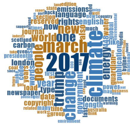
Climate change and global warming coverage in March 2017 from US (left) and UK (right) sources. For US: the Washington Post, the Wall Street Journal, the New York Times, USA Today, and the Los Angeles Times. For UK: Daily Mail and Mail on Sunday, The Guardian and Observer, The Sun, Telegraph and Sunday Telegraph, The Daily Mirror and Sunday Mirror, The Scotsman and Scotland on Sunday, Times and Sunday Times.