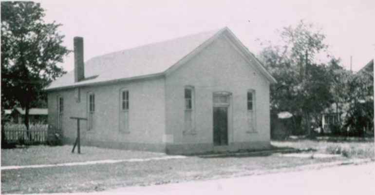
ALLEN METHODIST EPISCOPAL CHURCH