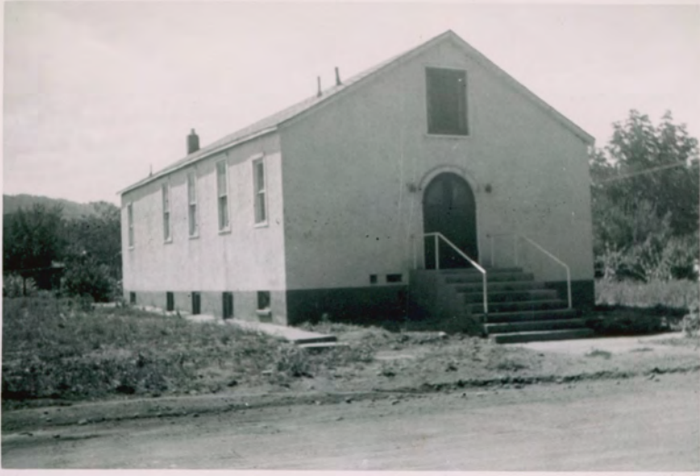
THE SECOND BAPTIST CHURCH