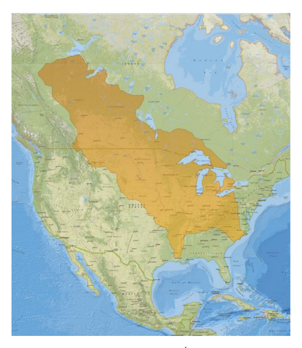
(Figure 3): Map of North America. An extent of Očeti Šakowiŋ presence, linguistic base, intermarriage and co-management of lands indicated in yellow.