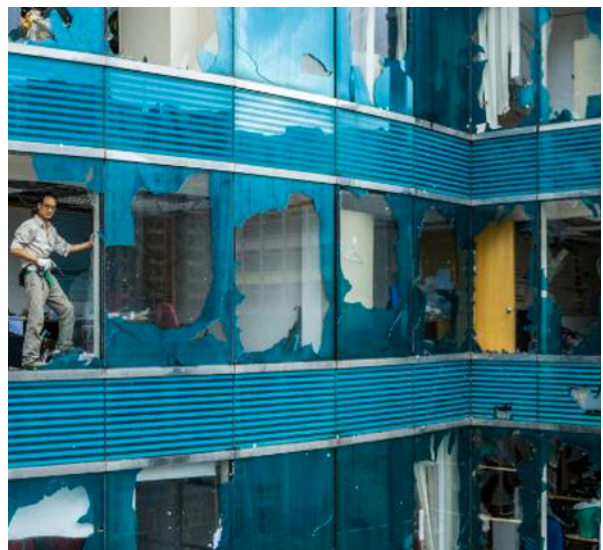
A man looks out of a damaged building in Hong Kong after Typhoon Mangkhut.

"Typhoon Mangkhut (locally called 'Ompong') in the Philippines and Hurricane Florence in the US earned media attention as the storms related to climate change or global warming. "