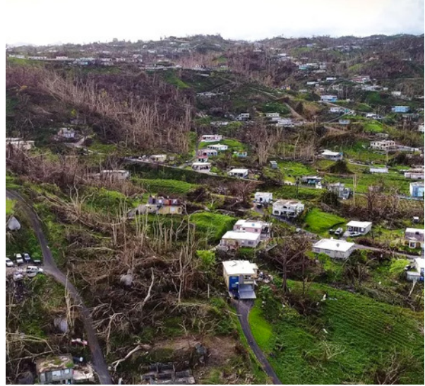
Yabucoa, Puerto Rico, still reeling from Hurricane Maria.

"There was media coverage of the mid-September 'tweetstorm' by US President Donald J. Trump, just before Hurricane Florence made landfall less than 24 hours later"