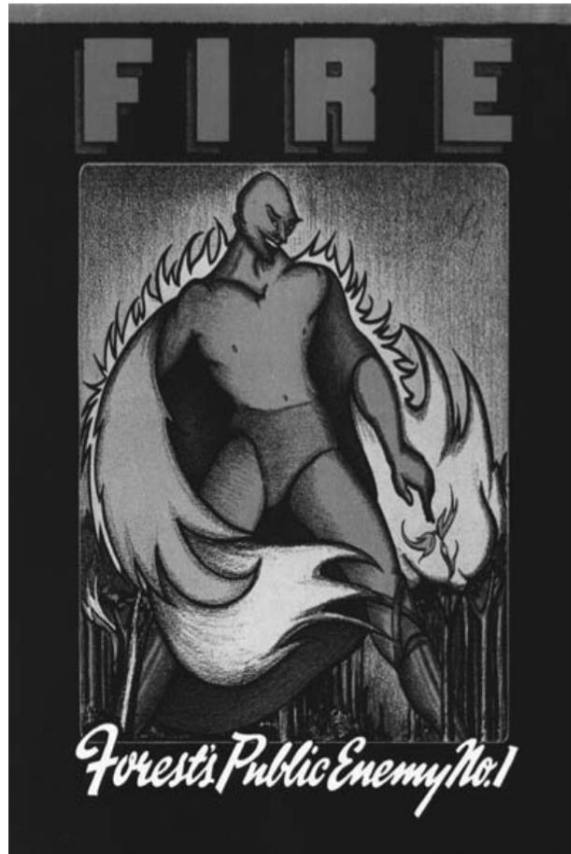
Figure 2: Depicts a propaganda poster designed to highlight and promote fire as the “red-menace”.

ecology, federal agencies continued to suppress fire. Fire suppression significantly within the US Forest Service who sought to protect “public” forests, land and science (USDA Official Site). “Public” is purposefully in quotation marks here because the U.S. forest service in California directly ignored the light-burning controversy; which predicted the buildup of fuels and demanded for Indigenous presence in their aboriginal forests (Nijhuis, 2015).