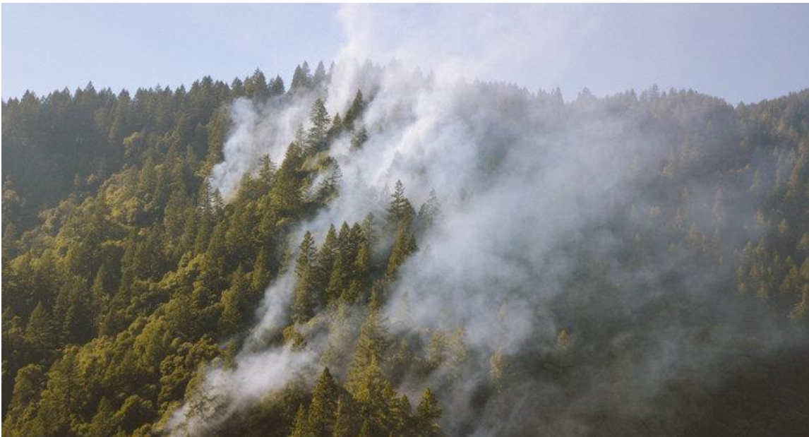
Figure 5. Shows the function of fire in the Klamath Region. A prescribed, controlled fire, with minimal smoke and not a single crown flame in sight. This photo shows an alternative version to fire, one that has beauty.

When the Klamath River TREX started in 2014, the prescribed burns were limited to Karuk privately owned land parcels, but within one year, their reach and scope have doubled. This year they trained 96 individuals from 25 different organizations, seven states, and two countries and burned 300 acres (Klamath River TREX, via Fire Learning Network, 2019).