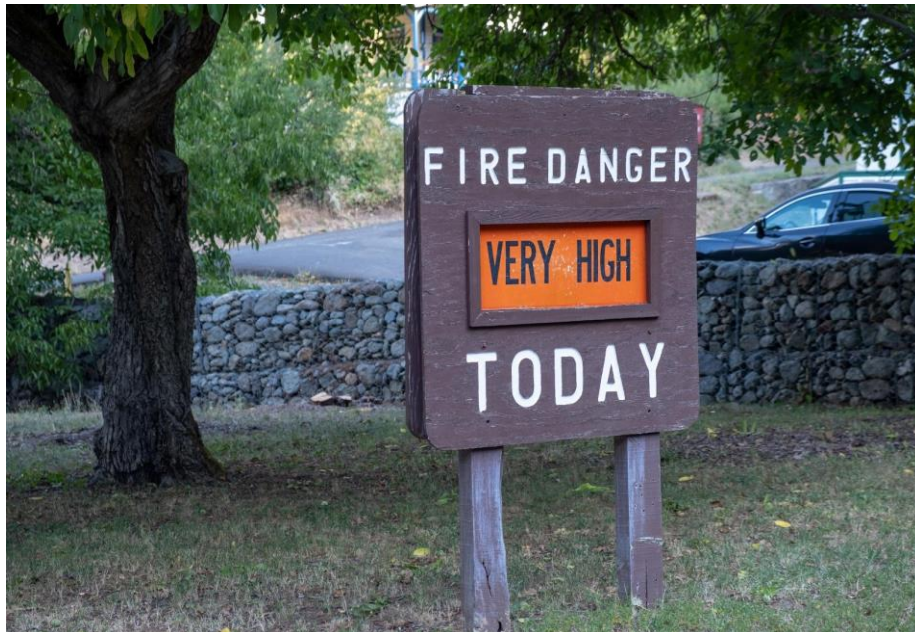
Figure 3. Original image taken by author, 2019. Located in a very small between Edna CA. and Orleans CA. In the middle of the Klamath Mountains. Signs such as this one was posted all with the 'very high' danger depicted. I took this to represent two aspects of the Klamath. The first aspect was that the brown sign is a very standard practice of the U.S. Forest Service. Clearly marking these lands as public space. The other was the severe risk for danger that many residents of this Klamath region are in.