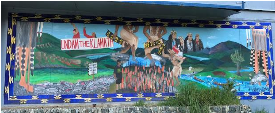
Figure 1 Original Image taken by Author. Painted on the side of a grocery store in Orleans, CA. The mural shows two sides of the Klamath region, on either side guarded by elders. On the left there are dead salmon, clear-cut and logged portions of forest, and a dam. On the right there is a flourishing ecosystem, living fish and the Karuk elders are watching over the Klamath. The mural also depicts coyote on the middle right dancing next to prescribed fire that is catching light to small flora and being controlled by a Karuk citizen. The ceremony shown in the center of the picture is a Karuk sacred tradition involving salmon and fire. There are also small fires in the upper right hand hills represent Karuk stewardship of their aboriginal lands.