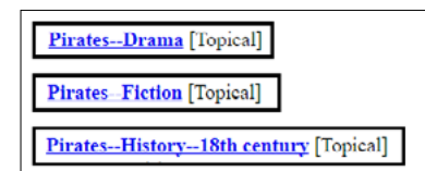
Figure 3. Subdivisions of the Subject Heading Pirates