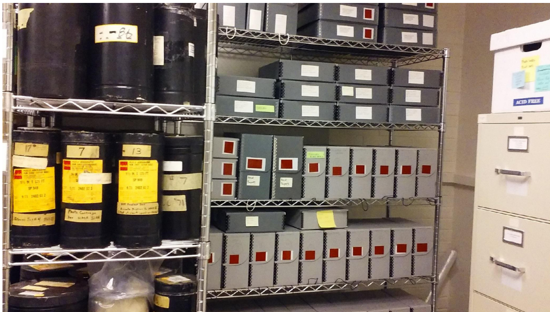
Fig. 3. Just a portion of the archive. The film canisters at left include tens of thousands of aerial sea ice imagery taken by the U.S. Navy in their 1960s “Birds Eye” project. These are the only existing copies.

of photography, exploration, or the role of women or minorities in these areas.