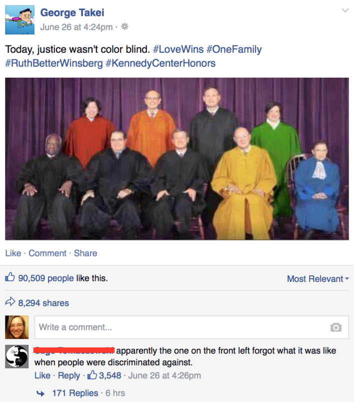
Figure 3. George Takei's Facebook post pertaining to the Supreme Court's ruling on same-sex marriage. The justices who were in the majority are shown with their robes in rainbow colors while the justices who dissented are shown wearing their typical, black robes. The most-liked comment on Takei's post demonstrates how Americans respond to black Republicans or, in this case, Justice Clarence Thomas. 146