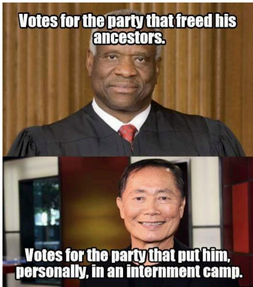
Figure 4. A meme that was circulating on the Internet after George Takei made his “blackface” comment that made light of the situation. 147