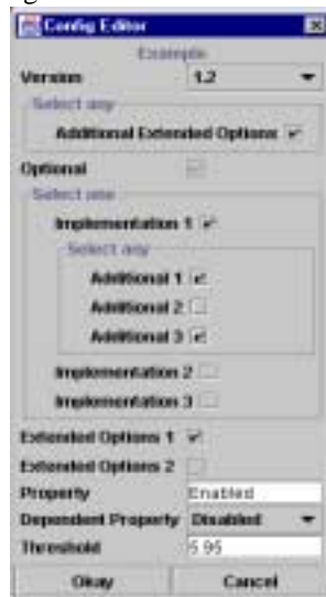
Figure 2: Configuration Editor

The update agent deploys a new, previously unavailable configuration of a deployed software system. The new configuration is provided in a new semantic description of the software system that the update agent retrieves from its release dock. The update process must account for a previously deployed configura-