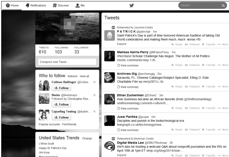
FIGURE 2. Twitter’s interface has been refined based on the ways users tweet.

created additional ways to use the functions. 12 Figure 2 displays some of Twitter’s current functionality.