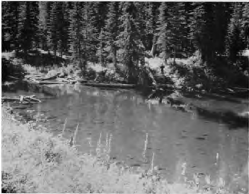
B. A typical forest pond of Grand Mesa. Note the figure on the far shore.