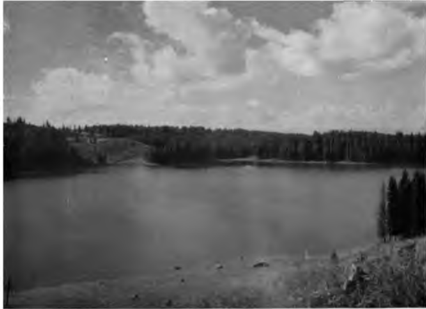
A. Ward Lake, Grand Mesa. The deepest spot, 20 meters, is about in the center of the photograph.