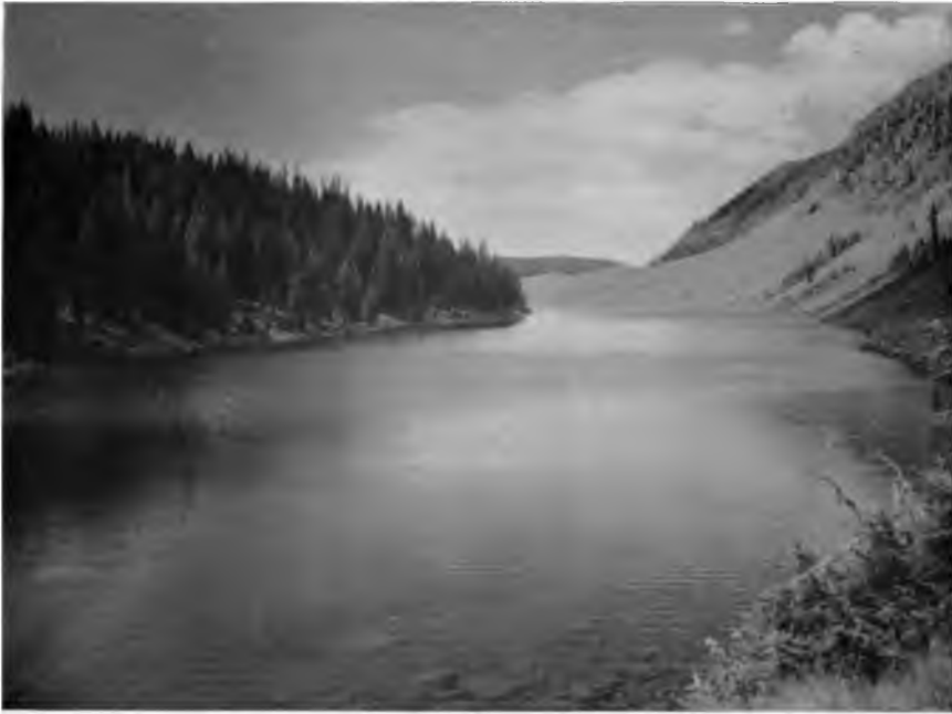
A. Butts Lake, Grand Mesa. A semidrainage lake.