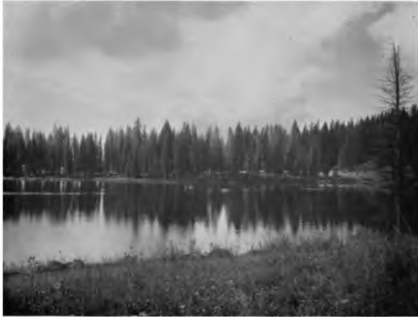
A. Carp Lake, Grand Mesa. A semidrainage lake.