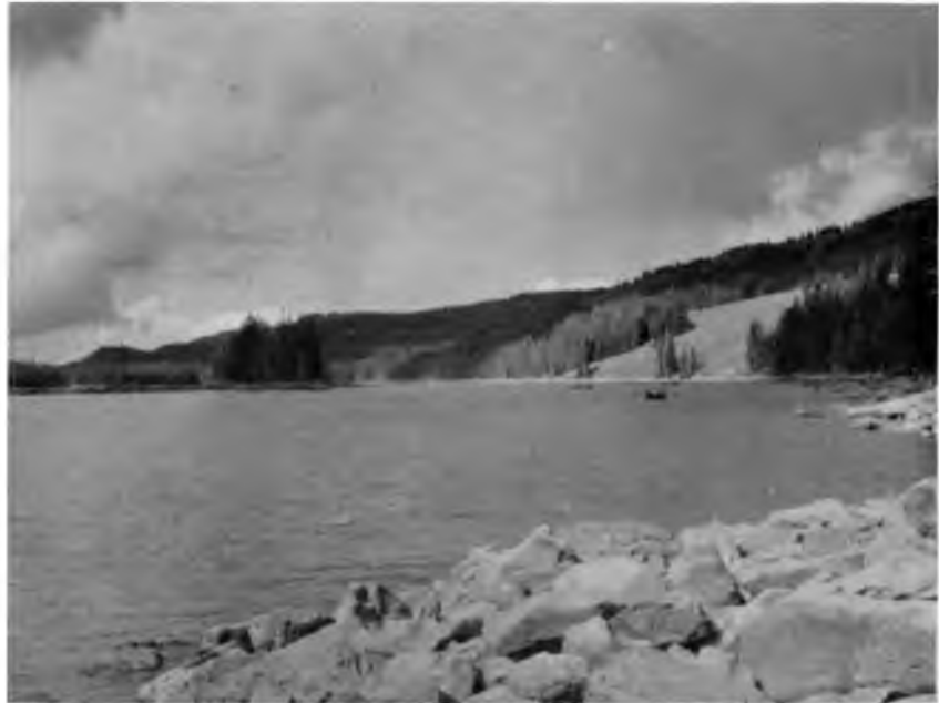
B. Island Lake, Grand Mesa.