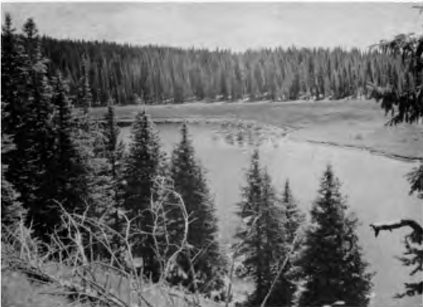
B. Bullfinch Lake, Grand Mesa. A semidrainage lake.