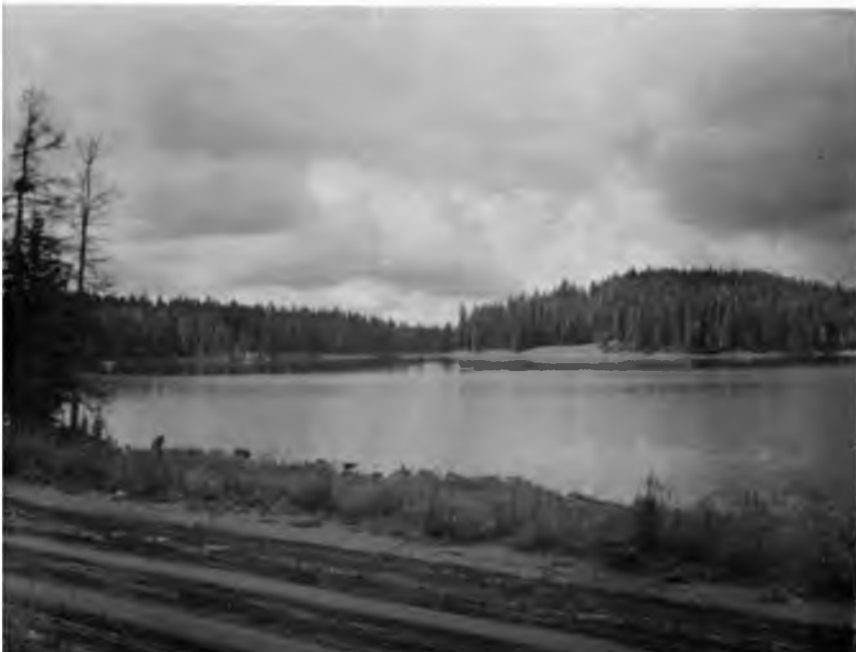
B. Barron Lake, Grand Mesa.