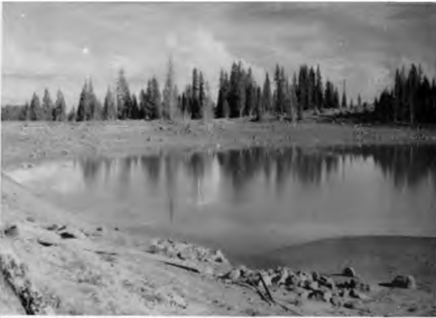
A. Military Park Reservoir at low water.