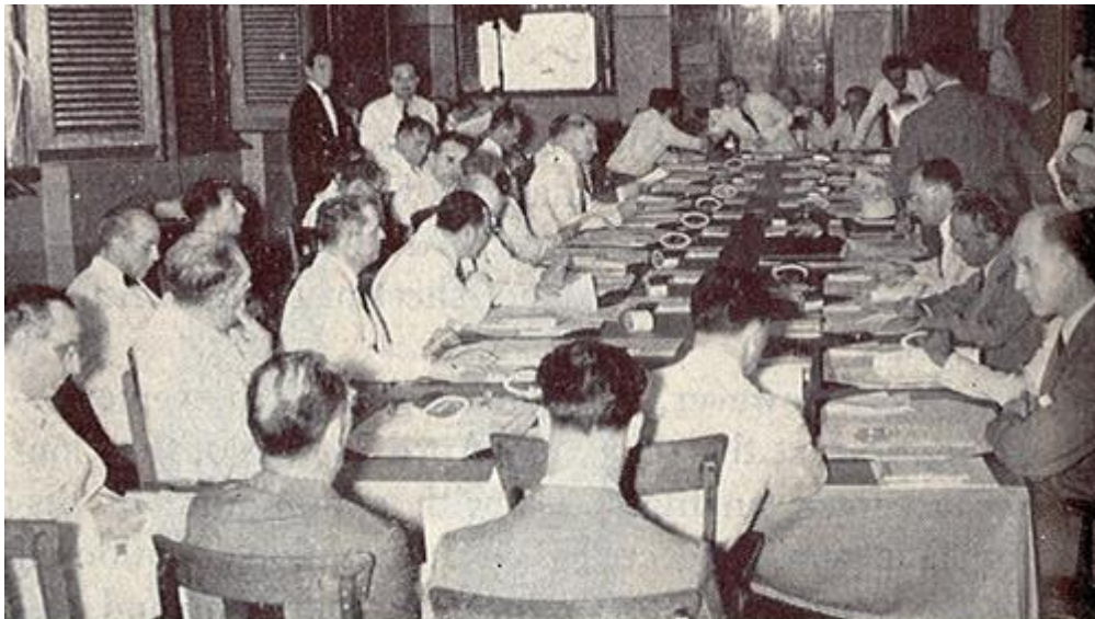
Inter-American union takes another step forward: First Meeting of Ministers of Foreign Affairs in Panama, 1939