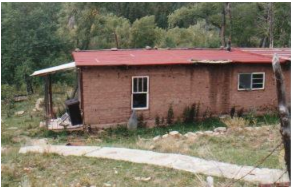
The house that my mom and her family built Las Tablas, New Mexico