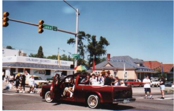
The Family Lowrider in the Fiesta Day parade Pueblo, Colorado