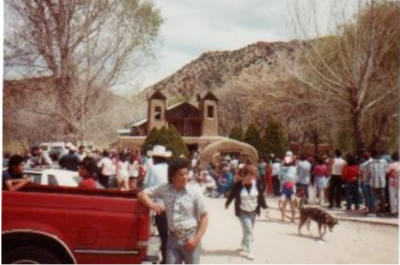
Santuario de Chimayo Chimayo, New Mexico