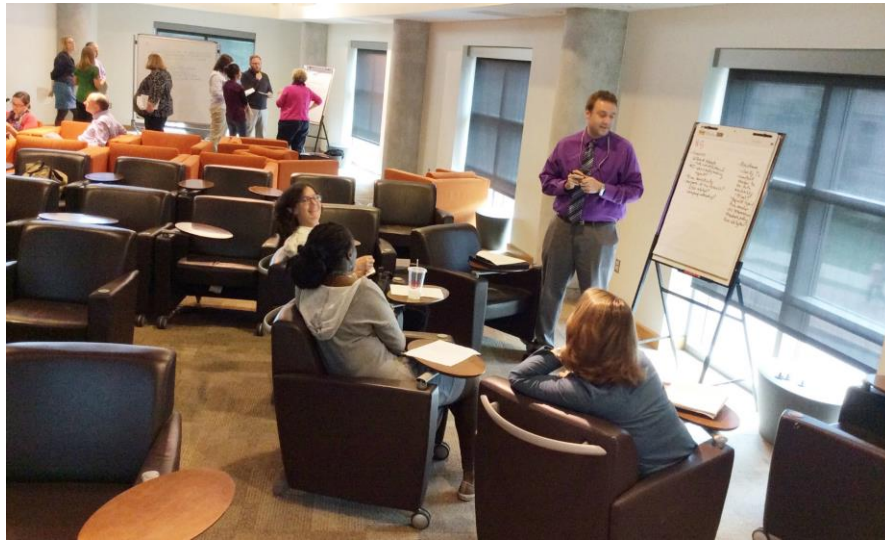
Engaged Librarian Forum. Small groups discussing their respective Case studies.

Swanson J, Reinhart AK (2016) Data in context: Using case studies to generate a common understanding of data in academic libraries . Journal of Academic Librarianship 42(1): 97–101. https://doi.org/10.1016/j.acalib.2015.11.005