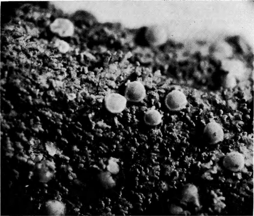
FIGURE 2. Pannaria saubinetii , detail of apothecia. Note absence of thalline margin, and paler rim of proper exciple ( \times 20 ).

Hasse) Hasse (= Massalongia microphylliza [Nyl. ex Hasse] A. Henssen, 1963). Two- and three-celled spores were found, contrary to Hasse's diagnosis, in P. ruderatula , thus eliminating the single character separating it from M. microphylliza .